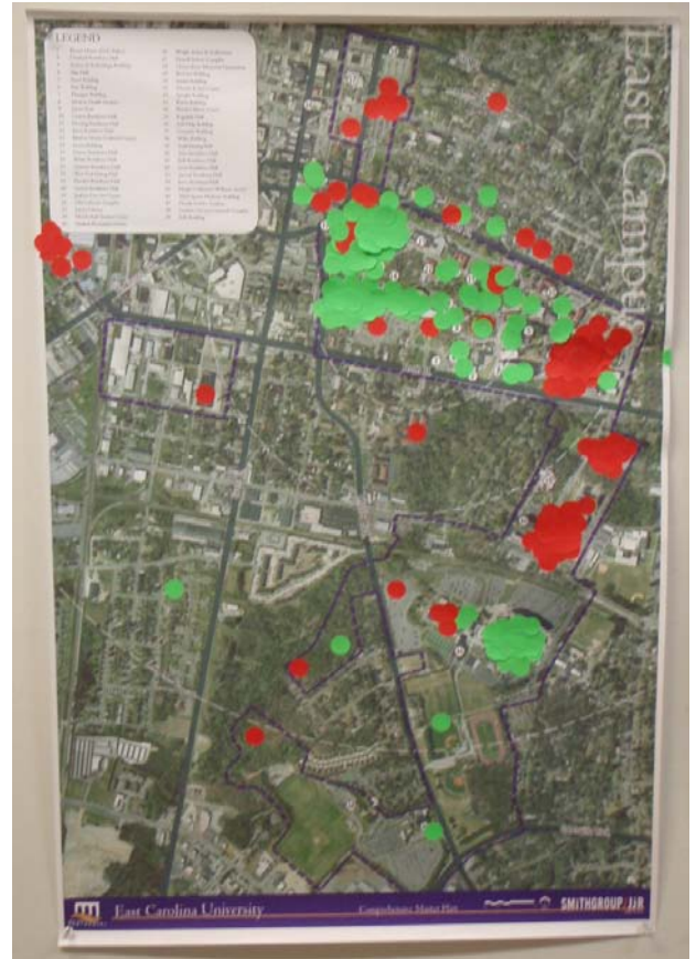
“Dot-Vote” Exercise Results

If this report does not agree with your records or understanding of this meeting, or if there are any questions, please advise the writer immediately in writing; otherwise, we will assume the comments to be correct.